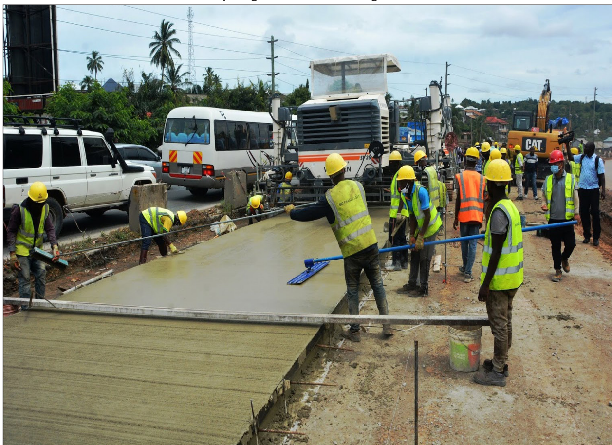
Dar es Salaam BRT construction project in progress

The minister urged Tanzania National Roads